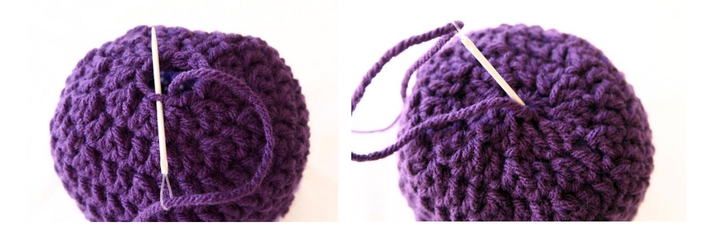
Round 13: Attach Accent Color on the opposite side of the second last foundation chain of Round 1 - Ch 1, sc in the same stitch and each stitch around, join in first sc, fasten off and weave in all ends. (45)

Cut the yarn, leaving a tail about 6" long. Using a yarn needle, weave the tail through the front loop of each stitch and pull gently to close the hole. Pass the needle through the center of the hole and pull to tighten completely.